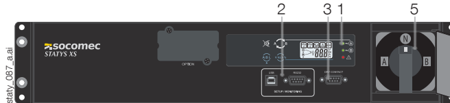
STATYS XS 32 A - hot-swap model