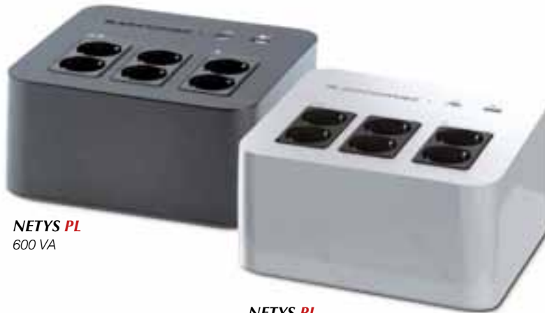
NETYS PL 600 VA