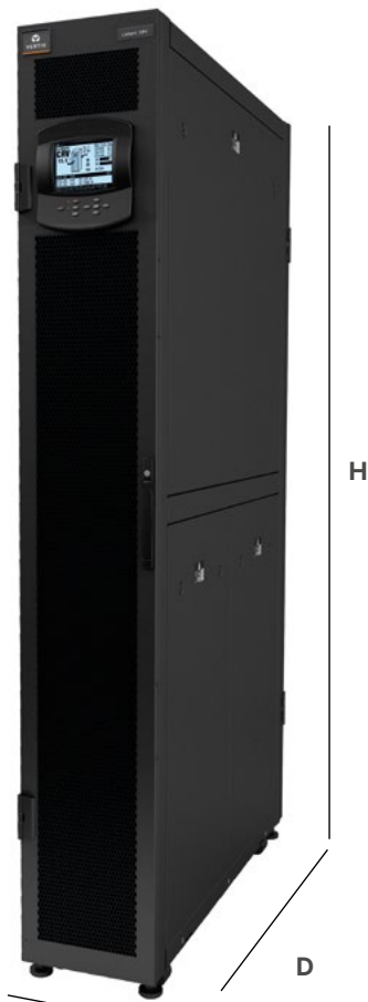
W Liebert® CRV 300 mm CW

Note: The performances shown above refer to an air inlet temperature of 38°C, condensing temperature for air and water-glycol cooled units of 45°C and a chilled water temperature of 7/12°C. (*) Unit available also with a 2200 mm height and 1200 mm depth.