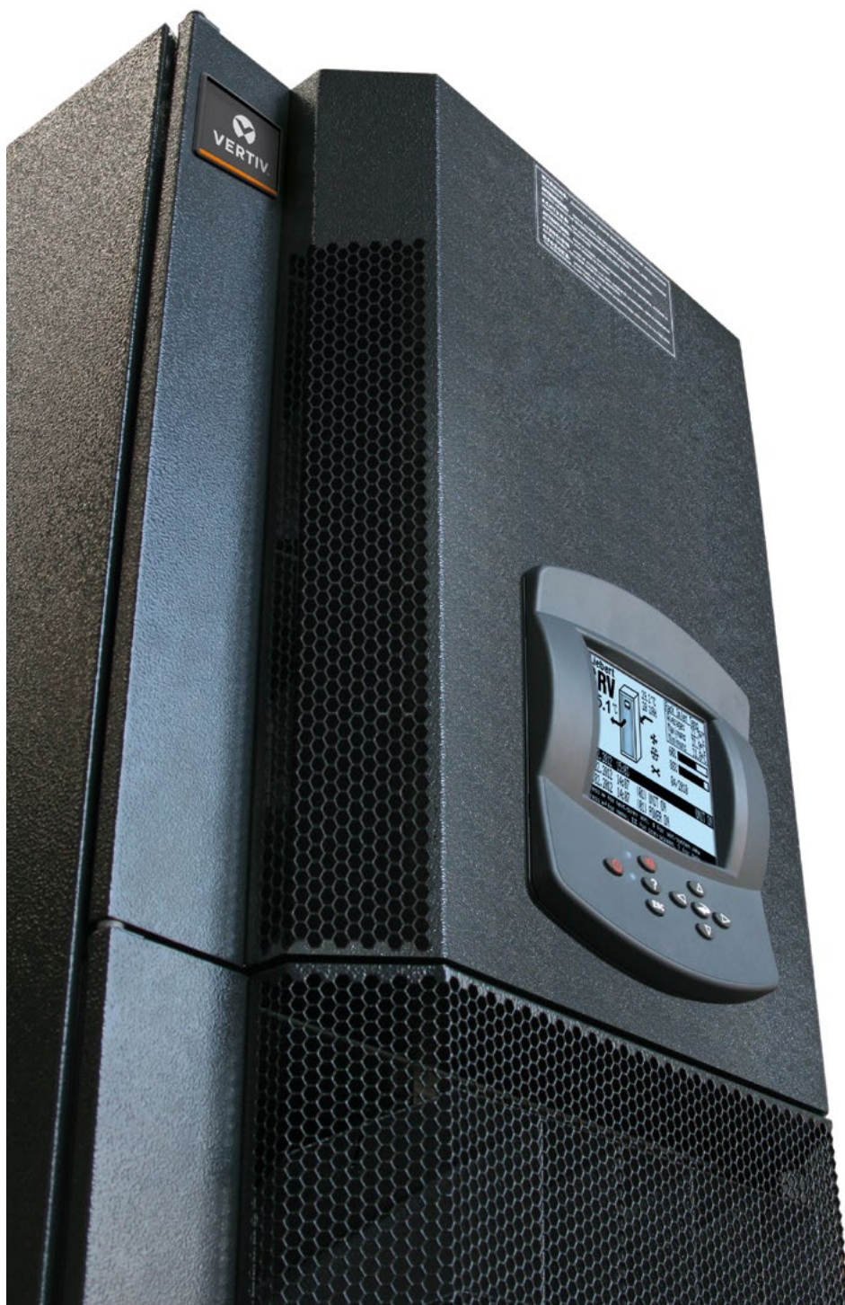
The Liebert CRV 600 mm, self-contained Thermal Management unit is ideal for the cooling of row-based applications.

The integrated compressors with cooling capacity modulation are designed to avoid peaks in absorbed power, thus reducing the stress placed on components. The Liebert CRV uses a dedicated control that also enables the compressor to operate when the external air temperature increases above standard limits.