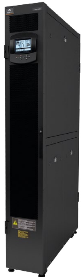
Liebert CRV 300 mm DX

The unit also allows ease of installation, through simplified cable and pipes routing from top and bottom of the unit.